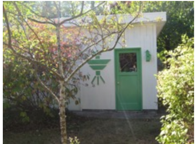
Backyard shed changed from brooding dark to cheery white and green.