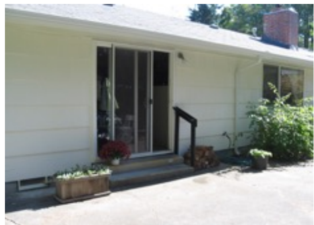
Back of house before and after. Thank you, Lions!